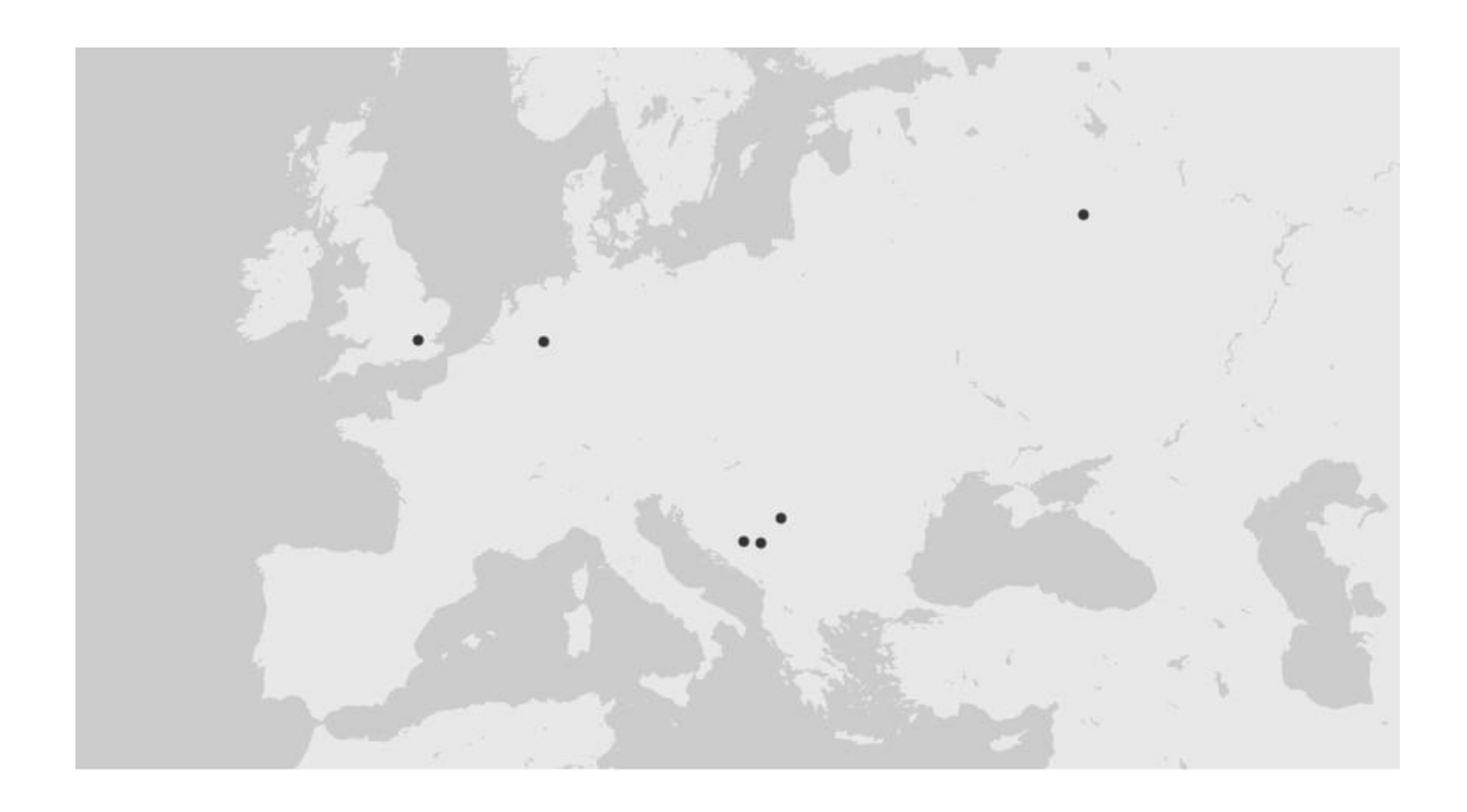
Map 4. Space in Clara Usón's and Saša Stanišić's novels