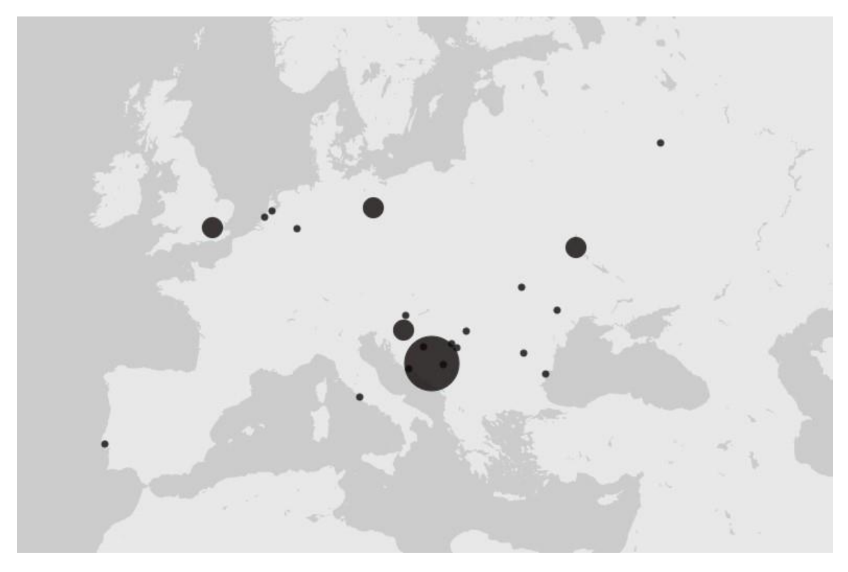
Map 2. Spaces in post-Yugoslav literature (European framework)