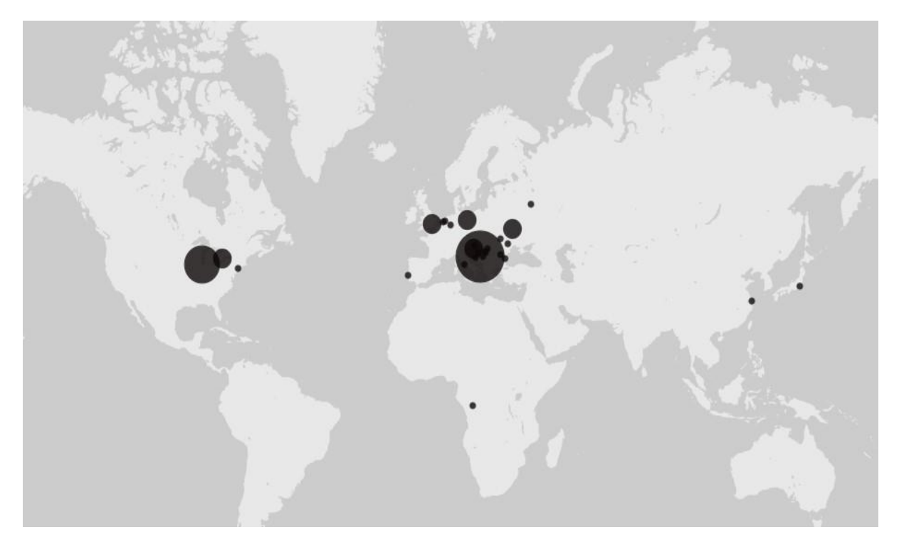
Map 1. Spaces in post-Yugoslav literature (Global framework)